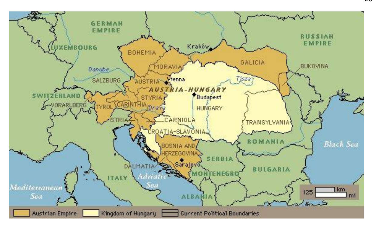
The Danube Monarchy