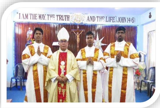
Hearty Congratulations Dear Conferrers