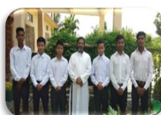
Tokobari - 6